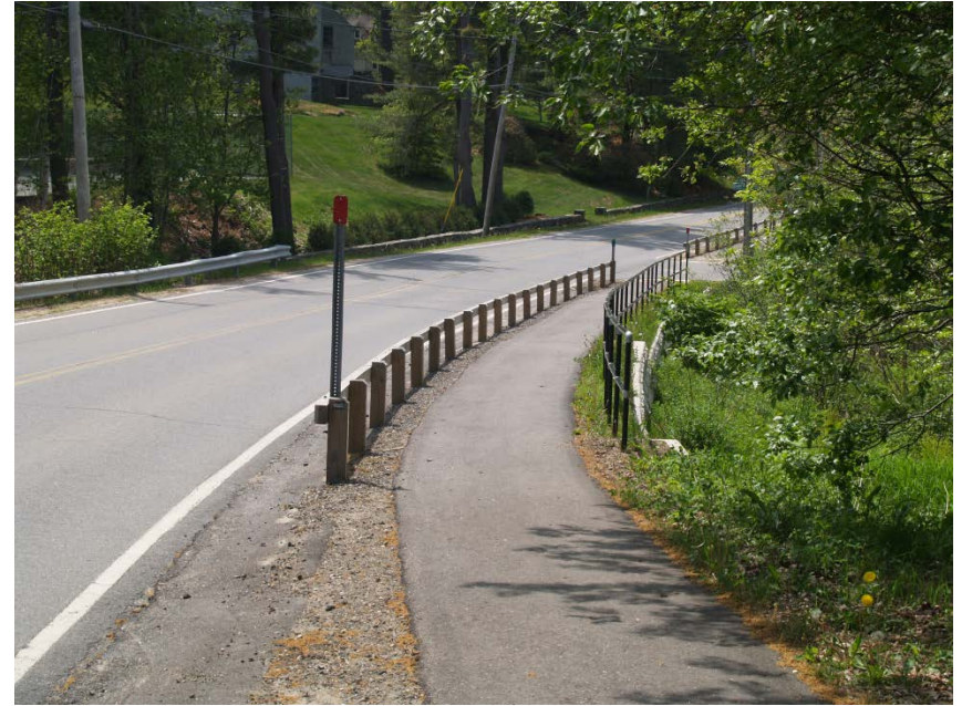
Guardrail Plus Slope Protection