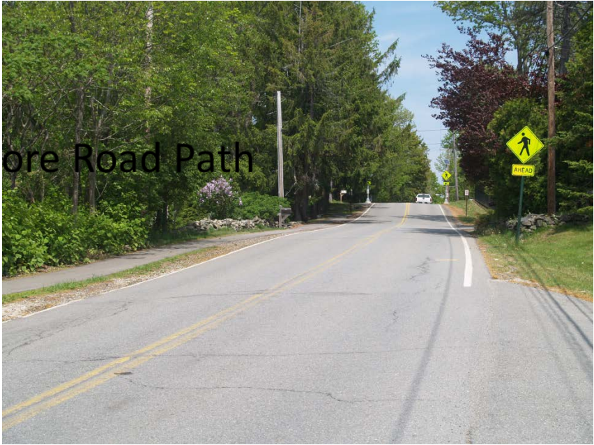
Little Change in Roadside Appearance